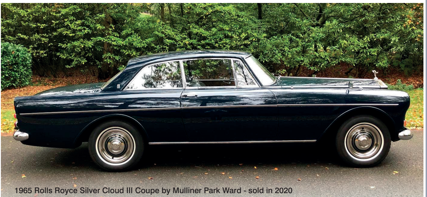
1965 Rolls Royce Silver Cloud III Coupe by Mulliner Park Ward - sold in 2020