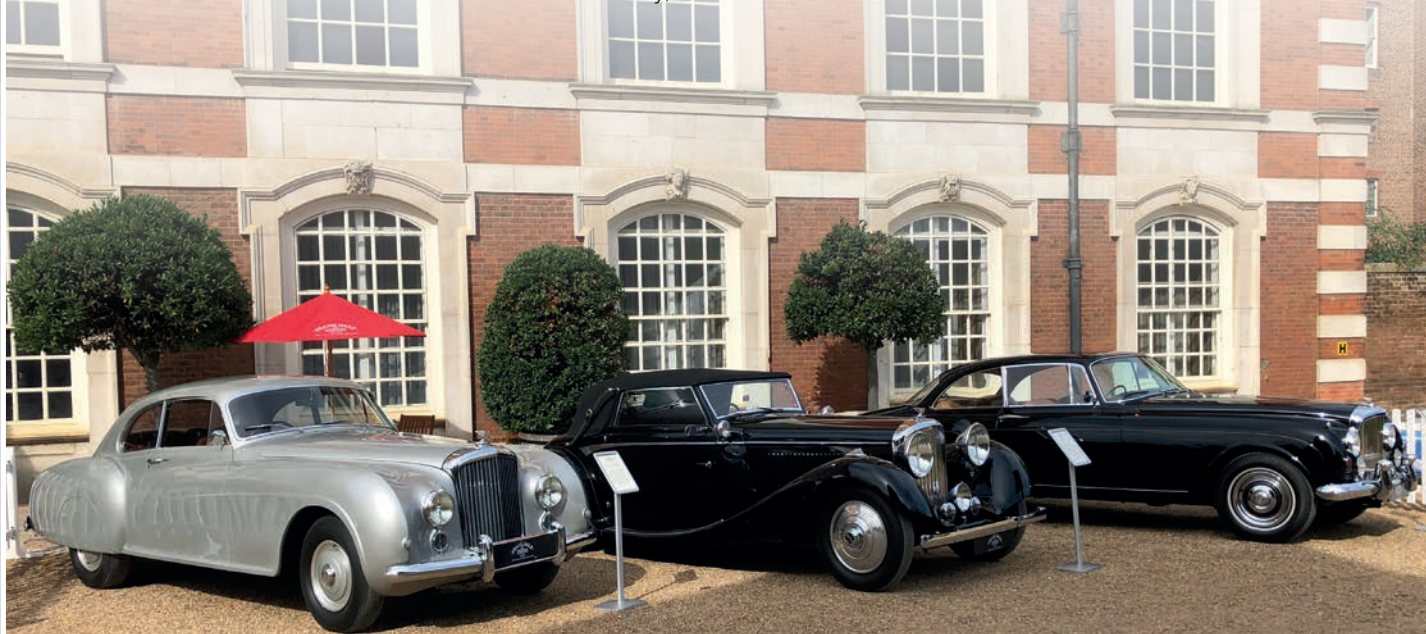
Our stand at Hampton Court this year

given the limitations within which the event could be held. It was a wonderful three days, even the weather was consistently welcoming, that culminated on the Sunday afternoon when I was asked to assist with the judging of the Bentley Drivers Club members cars. I was delighted to accept, and myself and the other judges decided on a beautiful ex Woolf Barnato Derby Bentley, an S1 Continental Fastback and a modern Bentley Brooklands coupe as the prize winners in each section, with the Derby Bentley being awarded first prize overall. Here is hoping that 2021 allows us to attend and exhibit cars at all of our favourite Concours d'Elegance and classic car events across Europe and North America. Fingers crossed.