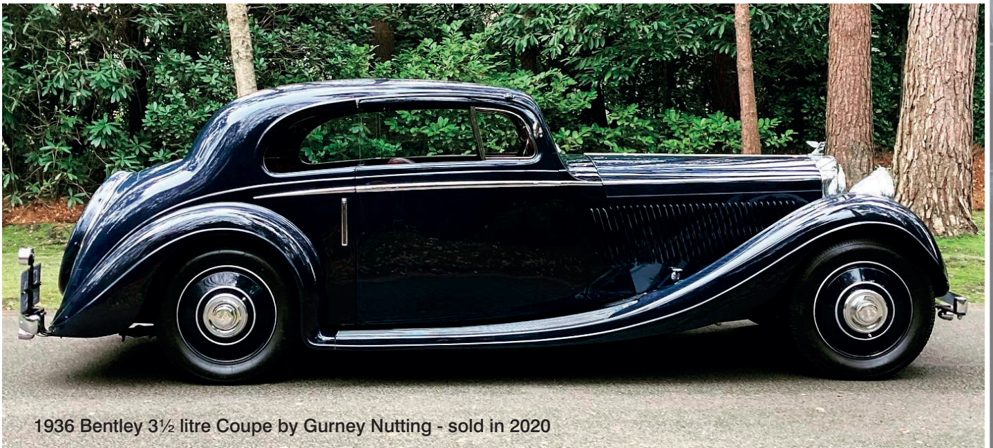
1936 Bentley 3½ litre Coupe by Gurney Nutting - sold in 2020