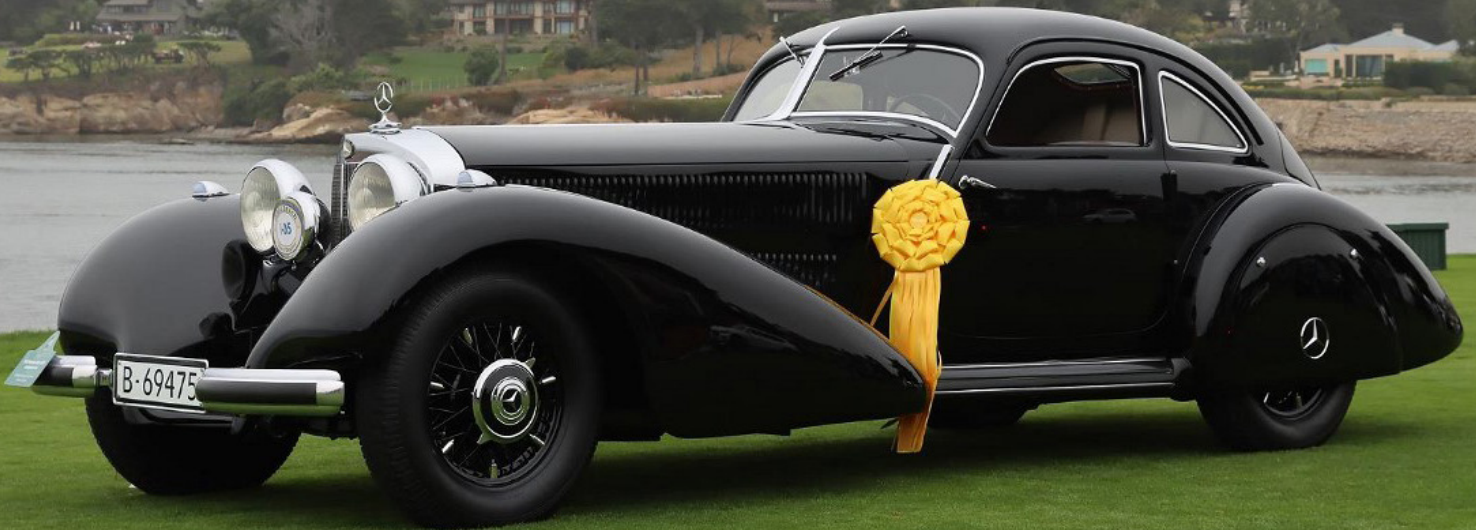
Best of Show winner at Pebble Beach 2021 Concours d'Elegance

With the pandemic still loitering in the shadows, live events in the UK were again limited during 2021, with the cancellation of both the Rolls-Royce Enthusiasts Club (RREC) and Bentley Drivers Club (BDC) annual rallies and concours events. However, some of the high-profile international events were able to take place, albeit sometimes not in their familiar slots in the calendar. Some of the major concours winners in 2021 included a 1956 Ferrari 250GT Tour de France at the autumnal