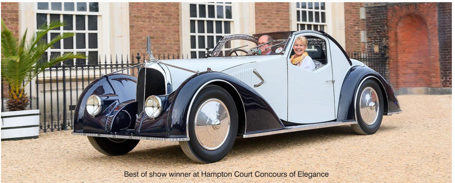
Best of show winner at Hampton Court Concours of Elegance