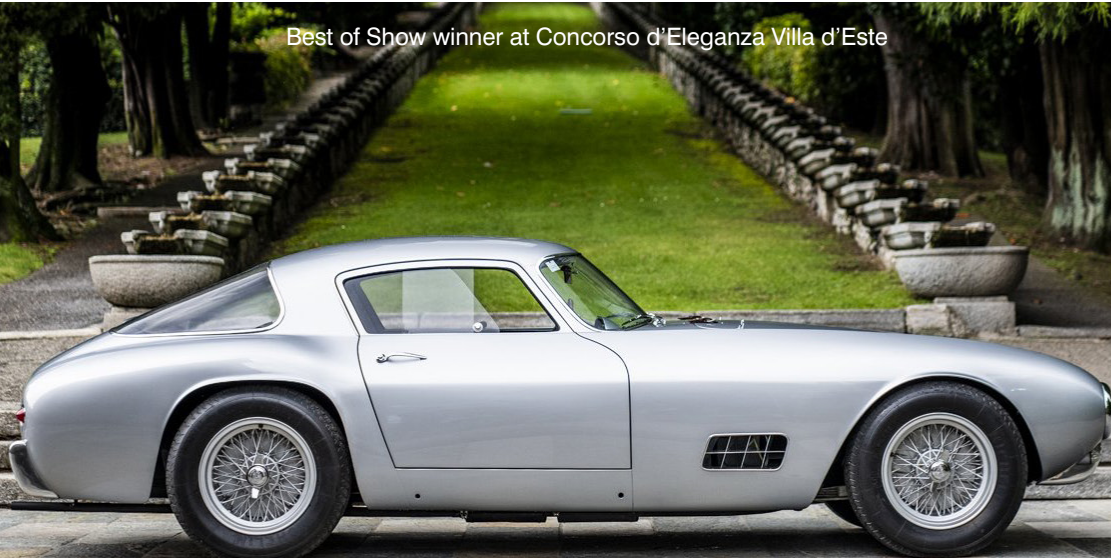
Best of Show winner at Concorso d'Eleganza Villa d'Este

Our own personal favourite amongst the major winners during 2021 was Arturo Keller's 1938 Mercedes-Benz 540K Autobahnkurier which triumphed on the biggest stage of all at Pebble Beach. One very special motor car!